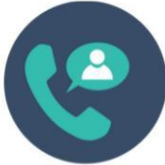
HR RETAINER SERVICE