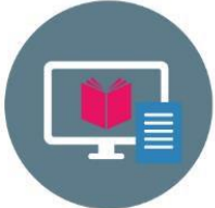
LEARNING & DEVELOPMENT