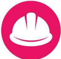
HEALTH & SAFETY